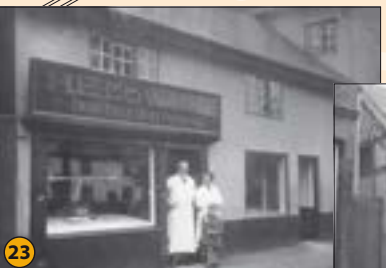
68 Main Street

Dedicated to the 2nd Volunteer Battalion of the Cheshire Regiment the archway leads to the army drill hall. The hall, built in 1901, served as a civic centre for the town on many occasions seating up to 800 people. Listed Grade II.