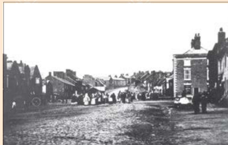
In the mid Victorian period a Butter Market was held in the town. This photograph shows the market taking place in an area that has now become one of the town's busiest road junctions, making a similar event today practically impossible. The imposing Georgian building on the right of the photograph is Crosbie House (16) and the distinctive Bears Paw can be viewed on the left (9). The Library (11) and the Fishermen's Cottages (14) can just be made out in the rear of the picture in the sweeping view up towards High Street. The reverse view, looking from the High Street down towards Main Street, can be seen in photograph (1).

The area has retained an interesting variety of buildings from the past and some of the key buildings, many of which are listed and feature blue plaques, can be identified on the map to the right. The town symbol, a honeybee, seen throughout on plaques and street furniture, was adopted in honour of Reverend Williams Charles Cotton, a former parish vicar and authority on bee-keeping.